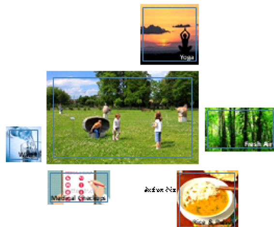
Figure-4: Few Ways Towards Simple Life.

Governments can make significant contributions to containing NCDs by increasing taxes on unhealthy packed food and simultaneously subsidizing healthy food to make it affordable for the mass population. Open and safe spaces need to be developed to encourage physical activities among all age groups. Workshops could be run in schools to educate children about healthy food habits and games. Additionally, mobile clinics need to be set up to reach and diagnose early and an informal group to provide counselling to sufferers of NCDs. Also, dedicated and controlled media should be used to teach healthy cooking with a budget to the masses. Fitness clubs could be formed at the local level to promote walking, yoga and similar activities together. The population needs to be educated frequently about age-specific routine medical checkups both at home and at the workplace to know early and treat early. This issue requires the collaboration of government, community and individuals to live a happy and healthy life. Our old age practices of fasting once a week along with several festivals across religions also indicate methods towards a healthy and balanced lifestyle. Another significant step would be increasing health insurance to the masses to confront tough medical situations easily.